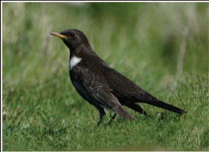
May Ring Ouzel